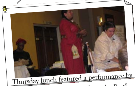
Thursday lunch featured a performance by Three Voices "Speaking from the Past"