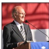
McGovern speaks at the dedication.

The George and Eleanor McGovern Library and Center for Leadership and Public Service was